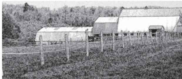
Hope's Edge Farm